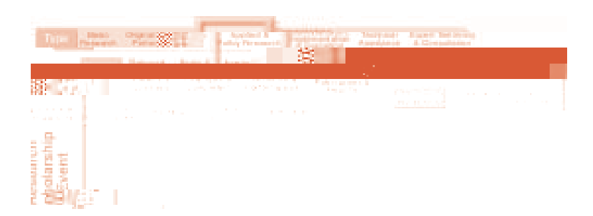
Figure 3. UniSCOPE Model of Research Scholarship

The "mix and match" features of the UniSCOPE model are also apparent here. For example, the results of basic research can be published in refereed journals for colleagues and professionals. That same information can also be used for creating applications through grants and contracts for corporations, communities, or government agencies. Many other combinations are also possible. We believe this model has the essential concepts for developing a comprehensive, fair, and equitable approach to recognizing and rewarding the full range of research scholarship.