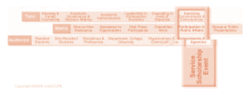
Figure 4. UniSCOPE Model of Service Scholarship

The types of service scholarship may be manifest in student advising, academic governance and decision making, academic administration, leadership in professional societies, assisting corporations and communities, and consulting based on the scholarly expertise of the faculty member. We consider the types of service scholarship to include advising, academic governance and administration, leadership in professional associations and societies,