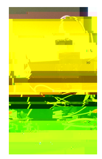
Figure: Scanning Electrochemical Microscope